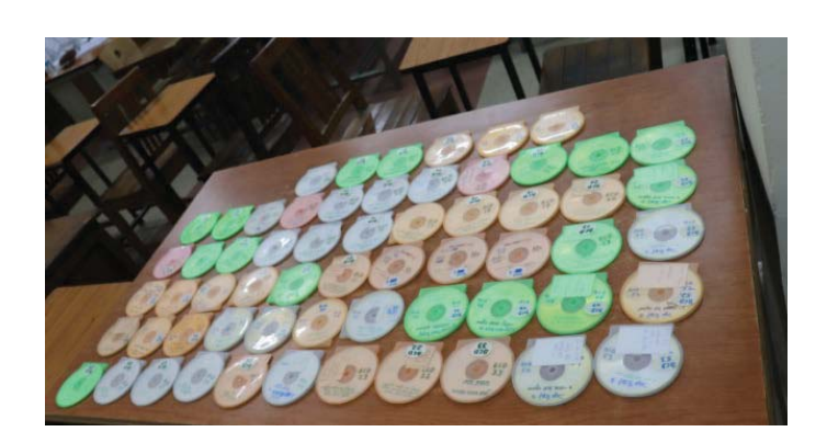
Talking Books in CD form