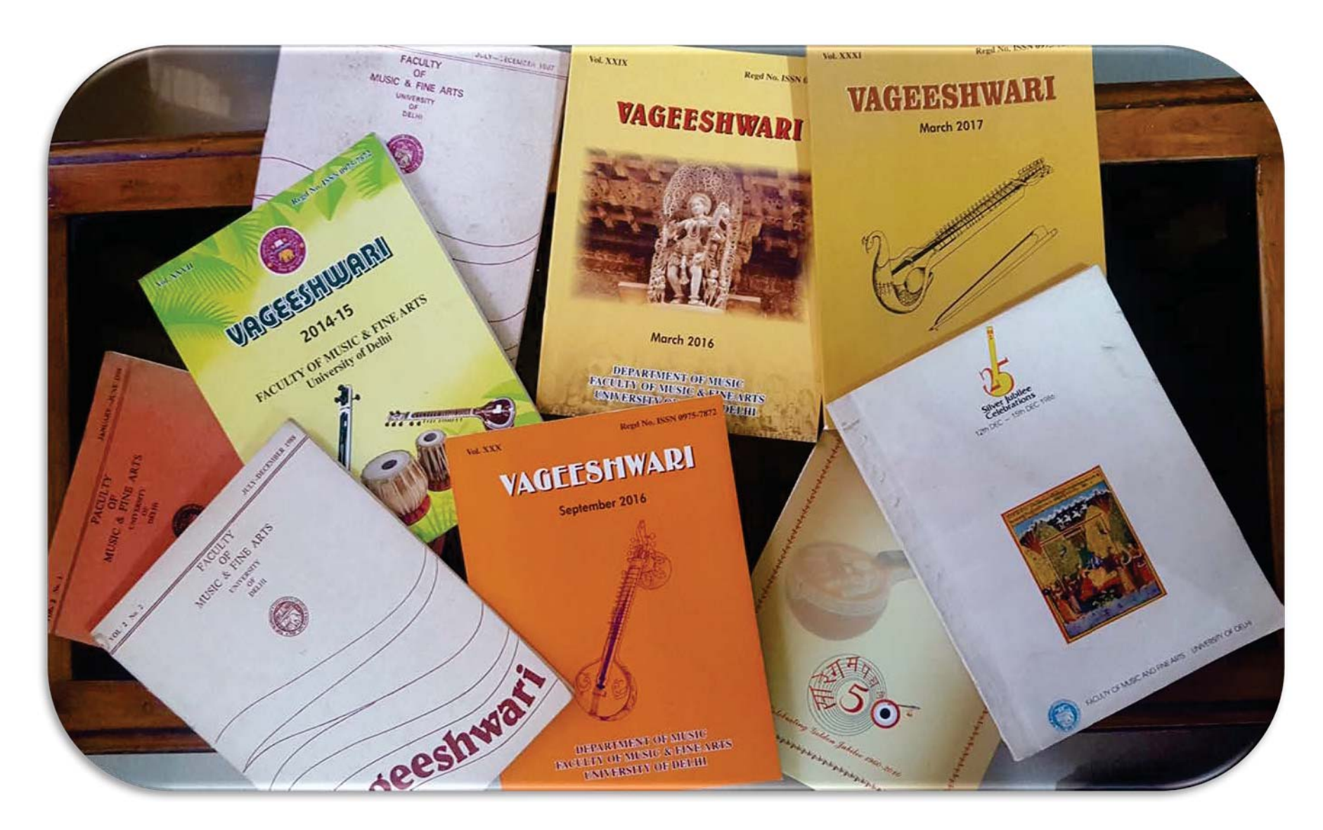
Vageeshwari Departmental Journal