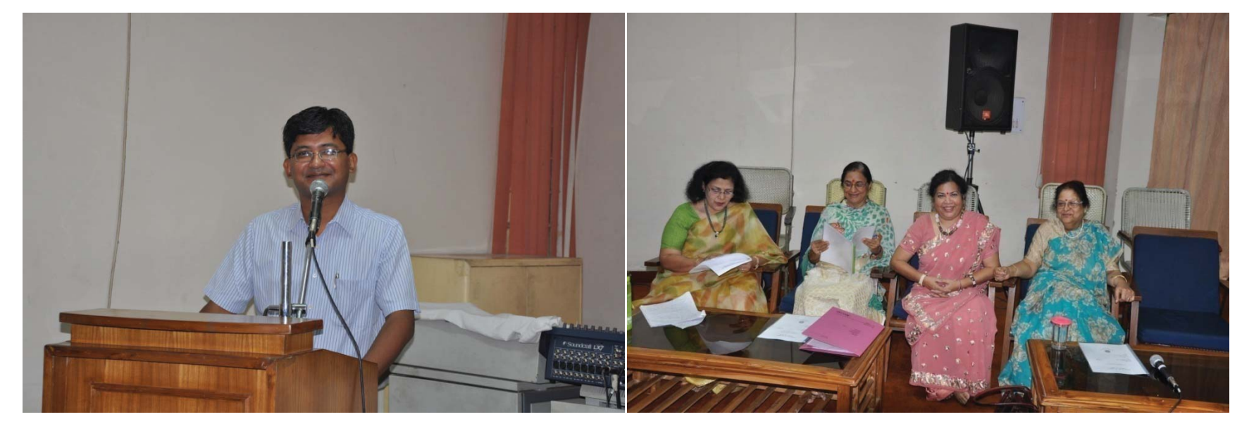
In-House Seminar for Ph.D Students – 22<sup>nd</sup> September 2017