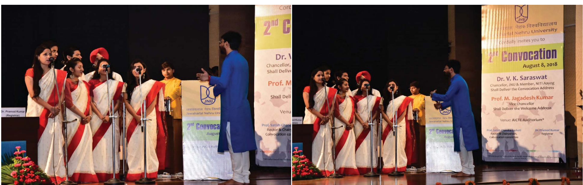
Sargam Choir presentation in JNU convocation on 8<sup>th</sup> August 2018