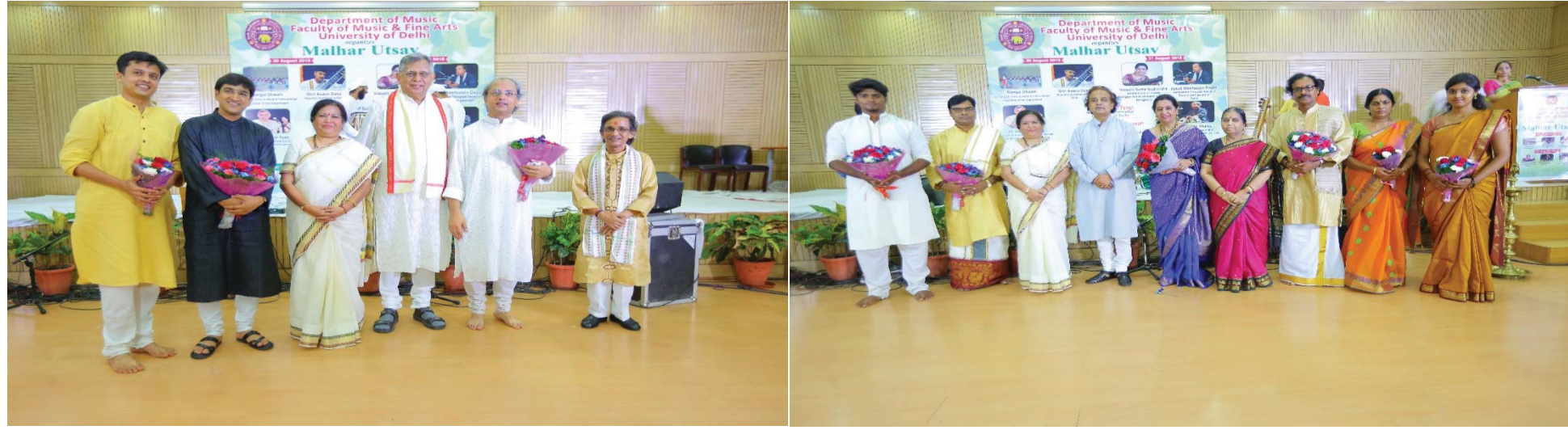
Malhar Utsav Celebrations - 30-31 August 2018