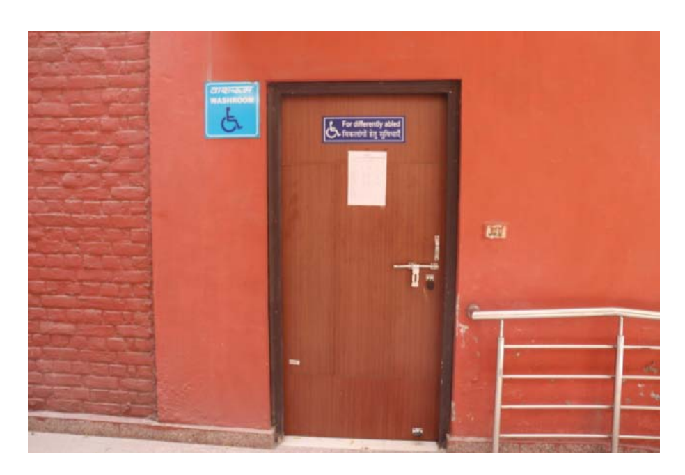
Washroom for differently abled