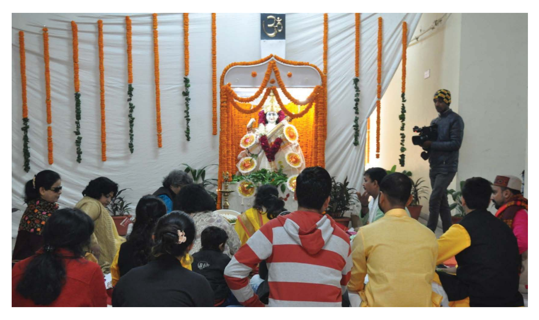
Worshiping Goddess Saraswati in traditional way on Basant Panchami