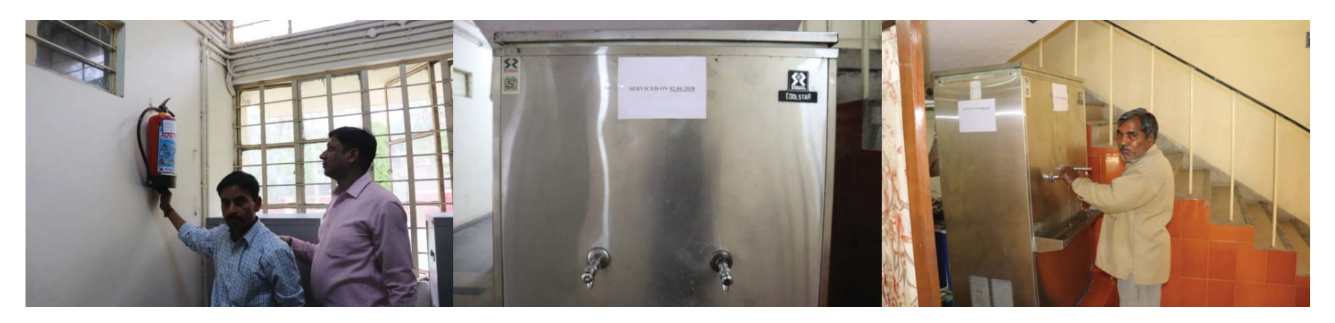
Water cooler serviced regularly