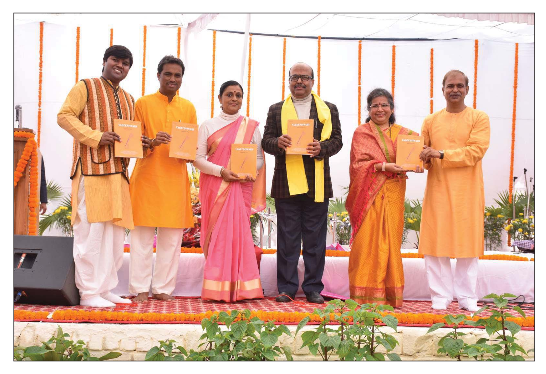
Releasing of Vageeshwari (Departmental Journal) Sep. 2016