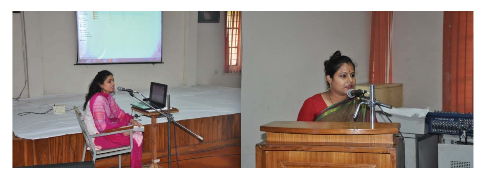
Ph.D. research scholars presenting their papers