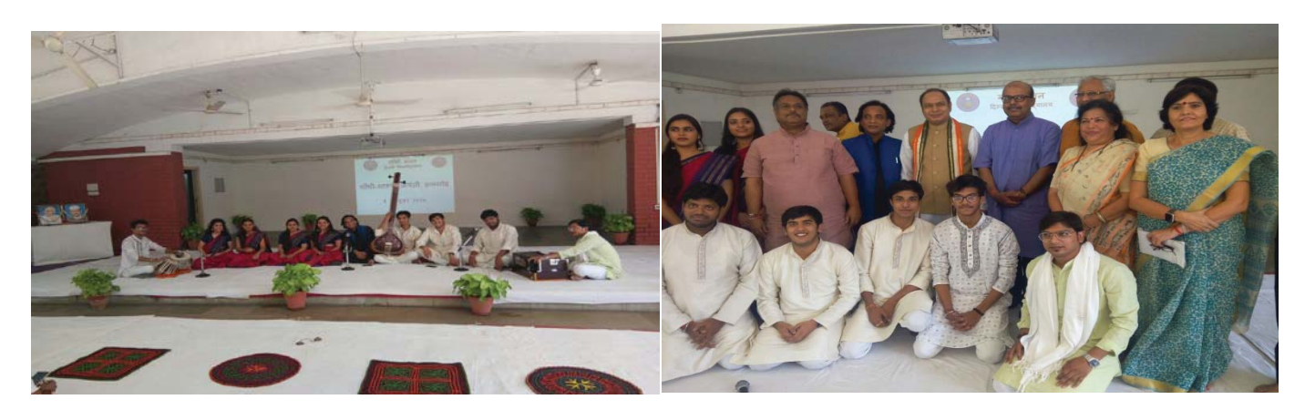
Sargam Choir Presentation at Gandhi Bhawan D.U on Gandhi Jayanti 2017