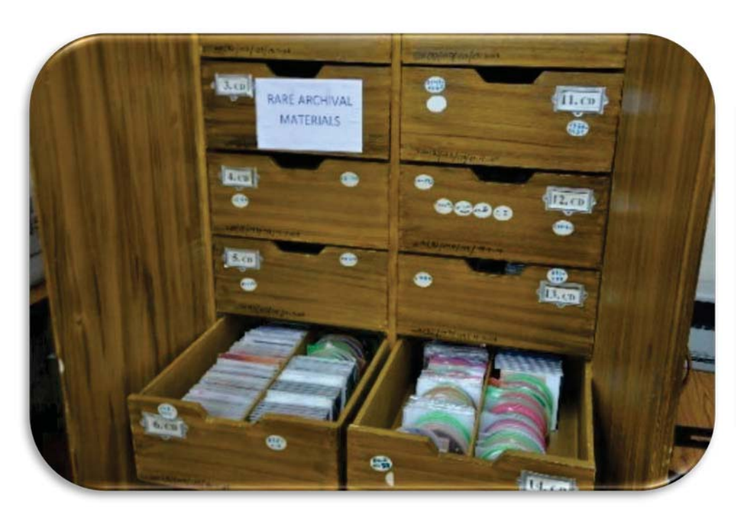
CDs of various recordings