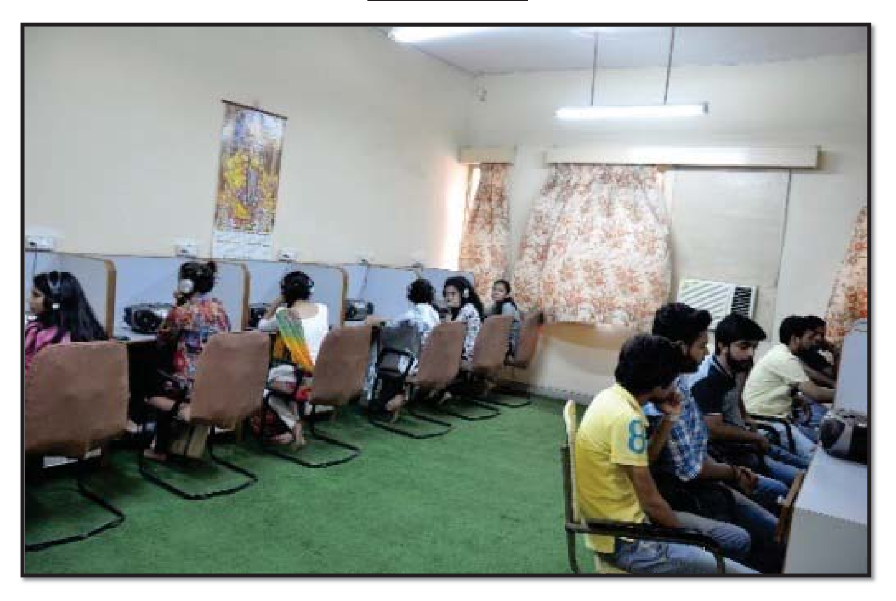
Students are listening to various CDs & recordings.