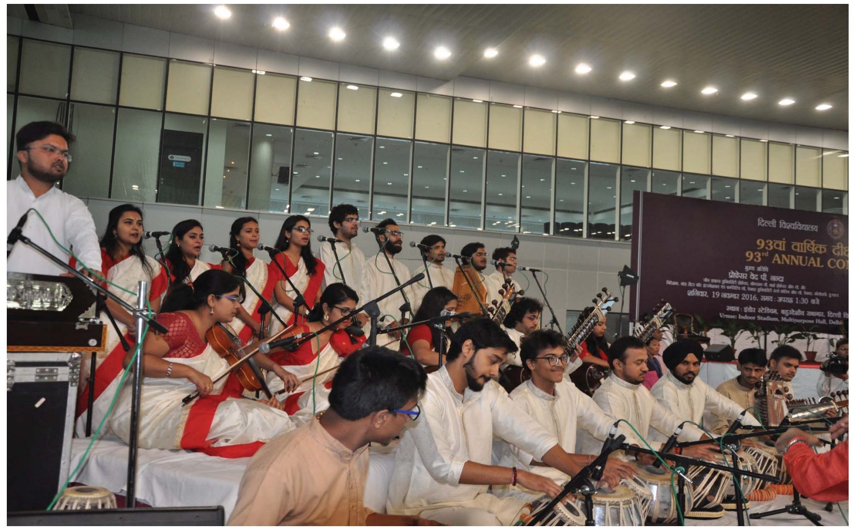
DEPARTMENT OF MUSIC, FACULTY OF MUSIC & FINE ARTS UNIVERSITY OF DELHI, DELHI-110007