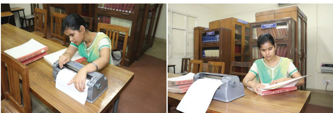
Visually Differently-abled Students Reading Braille Books and Writing on Brailler