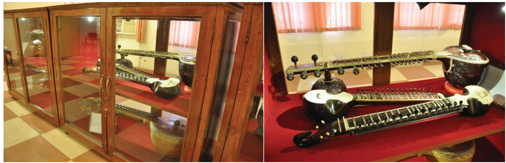
Different views of Musical Instruments gallery